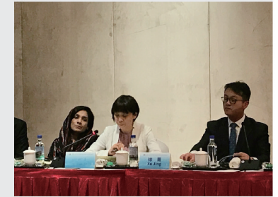
A corporate representative was speaking at the session.