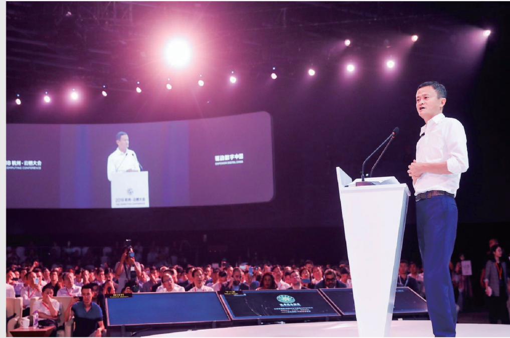
Keynote Speech by Jack Ma