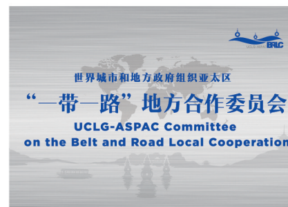
【 June, 2017】

The initiative to establish BRLC was approved in the UCLG-ASPAC Executive Bureau Meeting.