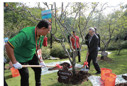
Tree-Planting in Friendship Forest