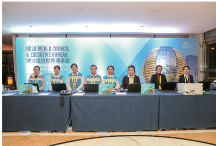
Volunteers at Information Desk