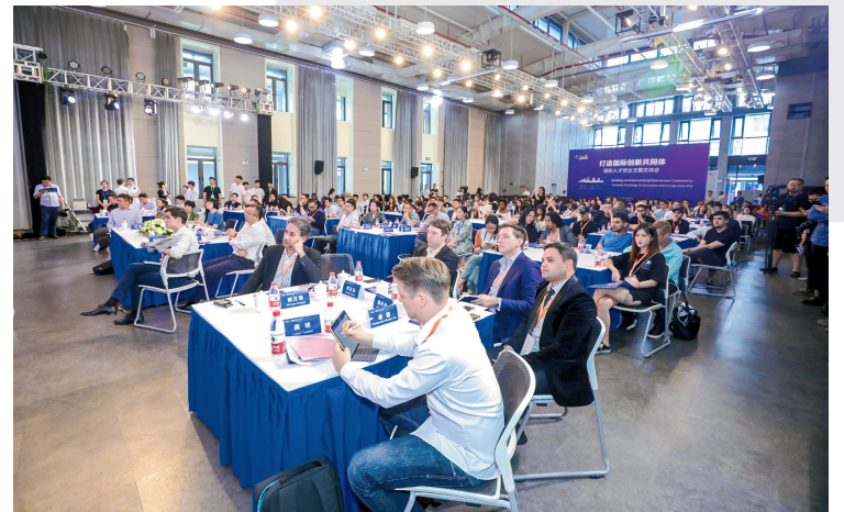
Forum on Innovation and Entrepreneurship