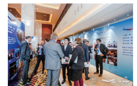
BRLC Photo Gallery