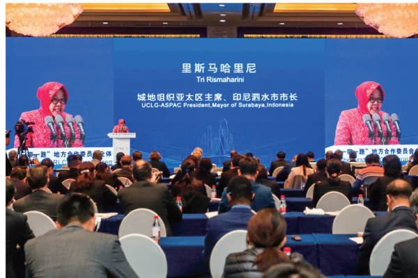
Opening Remark by UCLG-ASPAC President Ms. Tri Rismaharini