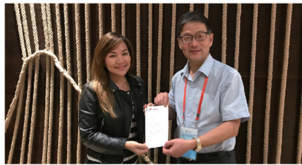
Catbalogan, Philippines signed up to join BRLC.