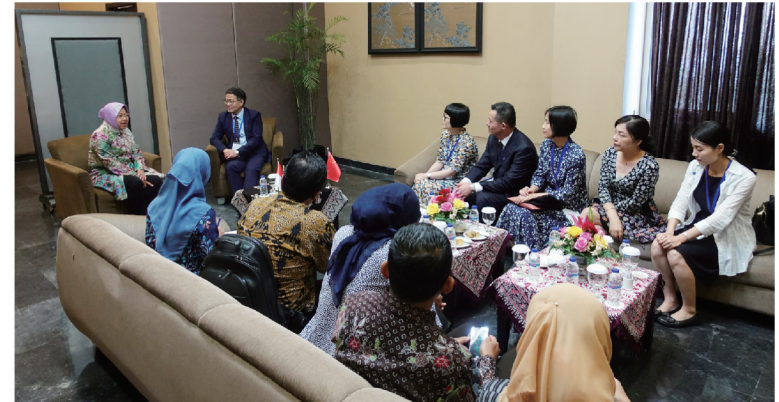
Meeting with newly-elected UCLG-ASPAC President, Mayor of Surabaya, Ms. Tri Rismaha