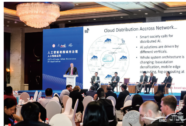
Seminar on "AI Facilitates Urban Governance"