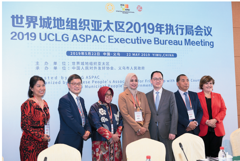
BRLC Special Session guests

On May 21 st , the BRLC 2019 Special Session was successfully held during the 2019 UCLG ASPAC Executive Bureau Meeting to report on recent work of BRLC. More than 60 representatives of BRLC members, UCLG ASPAC city members and representatives of observation cities at home and abroad attended the meeting.