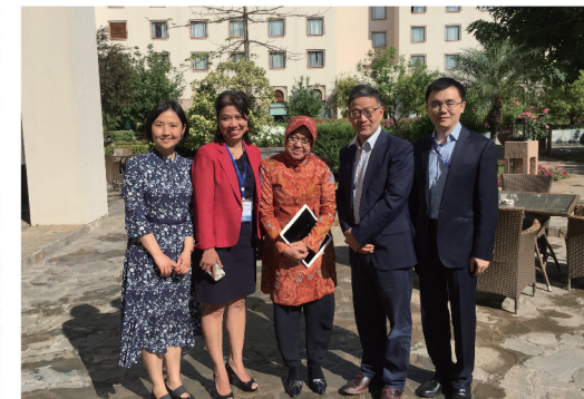
Group Photo with UCLG-ASPAC SG & the Mayor of Surabaya