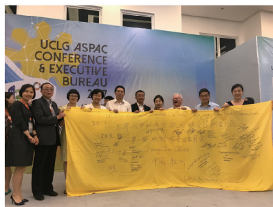
【 April, 2017】

President Xi Jinping proposed to build a " Silk Road Economic Belt" in Kazakhstan.