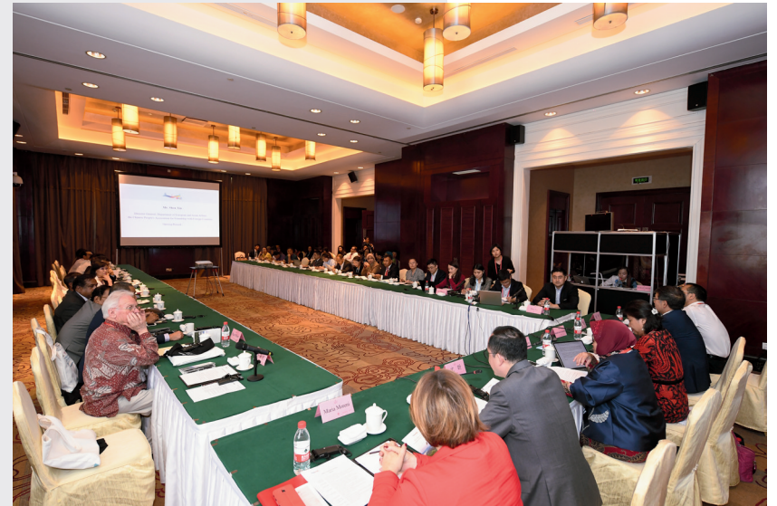
BRLC Special Session