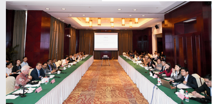
BRLC Special Session