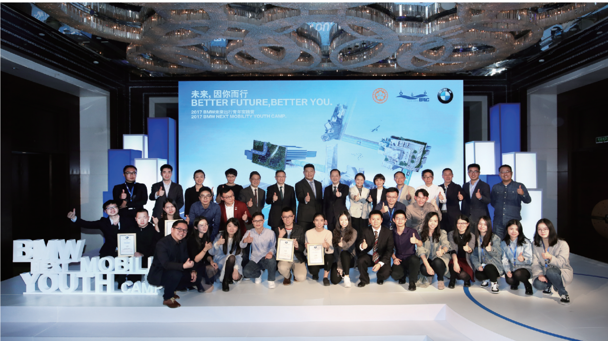
Group Photo of Award -Winning Representatives