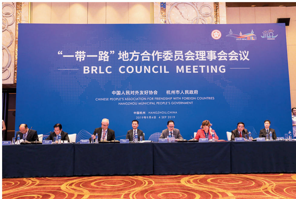
BRLC Council Meeting