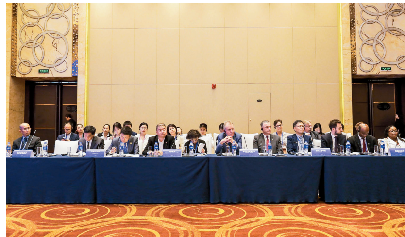
BRLC Council Meeting