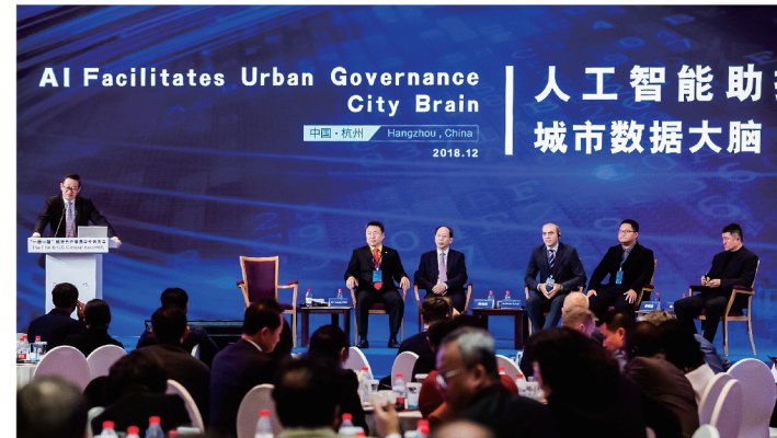
Seminar on "AI Facilitates Urban Governance"