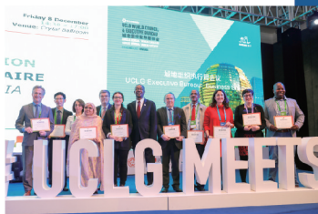
Group Photo of Delegates