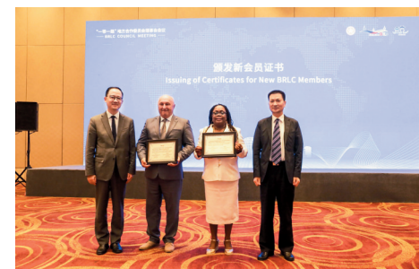
Issuing of certificates for new BRLC members