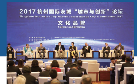
Culture and Branding Forum