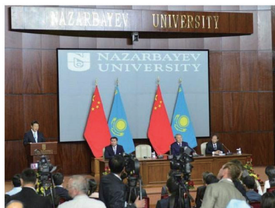
【 September 7th, 2013】

President Xi Jinping proposed to build a " Silk Road Economic Belt" in Kazakhstan.