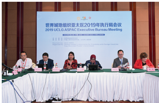
BRLC Special Session