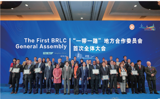
Group Photo of Founding Members