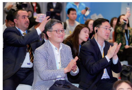
Forum on "City, Technology, and me"