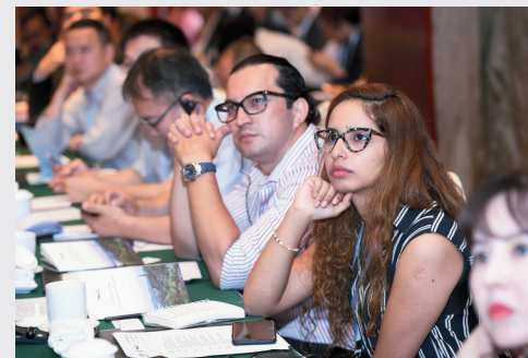
Participants of BRLC Special Session