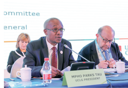
UCLG President Parks Tau

BRLC hosted the 2017 UCLG World Council Meeting and Big Data & Smart City Forum.