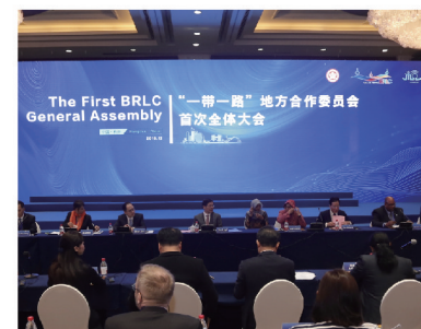
【December , 2018】

BRLC was inaugurated with the Secretariat located permanently in Hangzhou.