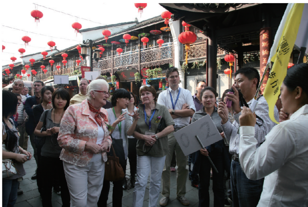
Visit to Hefang Street