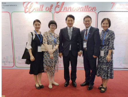
Group Photo with the former UCLG-ASPAC President, Mr. WON HEE-RYONG

In mid-September 2018, the Secretariat of BRLC attended the 7th UCLG ASPAC Congress in Surabaya, Indonesia and hosted the 2018 Annual Meeting as well as Hangzhou Thematic Exhibition. Several Hangzhou-based enterprises, including Alibaba Group and Hikvision, made promotional presentations during the meeting.