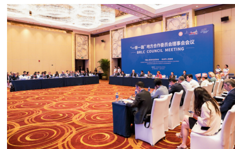
BRLC Council Meeting